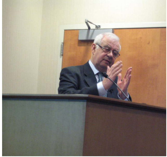
That looks more like it.