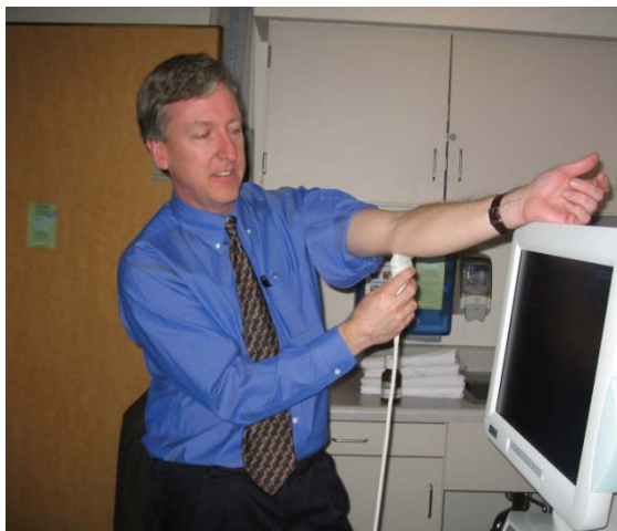
Learning to do peripheral nerve ultrasound (why is the screen blank?)