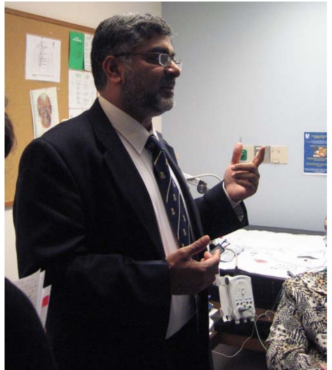
Zaem – how to inject botulinum for blepharospasm