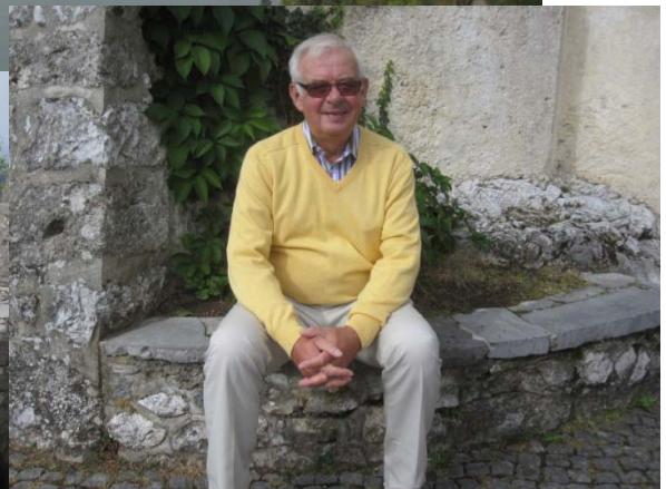
? George Clooney